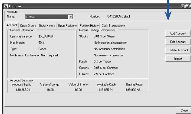
OmniTrader's Simulated Paper Broker Interface

OmniTrader's Portfolio is designed in such a way that you can use the Paper Broker to manage your trades with ANY broker you choose. This process involves using the Trade Notification window to record your actions with the external broker on a daily (or intraday) basis. See the tutorial called, "Notifications and Confirmations" in the tutorial package for information on how to do this.