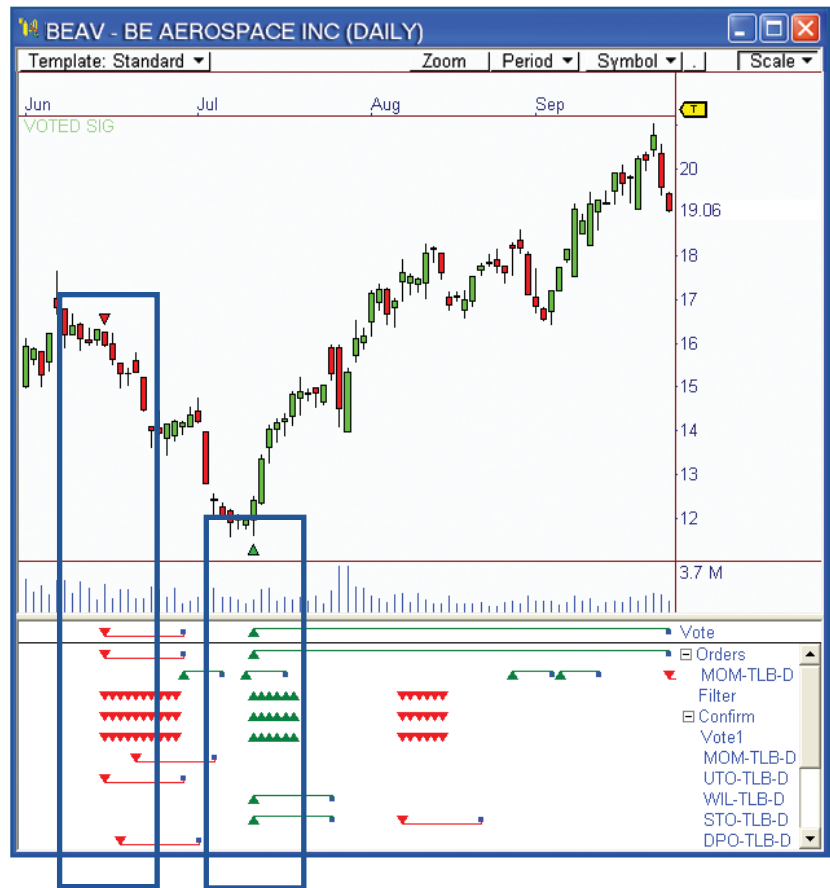
Signals on BE Aerospace using the iTLB Reversal Strategy . When multiple iTLB systems fire at the same time, there is usually a strong reversal indicated.

The iTLB 3.0 plug-in is a powerful addition for your OmniTrader tool box. The great thing about OmniTrader is you can activate these Strategies in addition to others you are already using to find the earliest confirmed reversals in your list. iTLB finds reversals quicker than any other method!