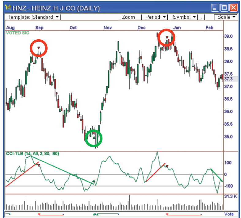
The Commodity Channel Index (CCI) is another indicator that cycles between overbought and oversold levels. Here is the CCI-TLB system, illustrating profitable reversals on HNZ.