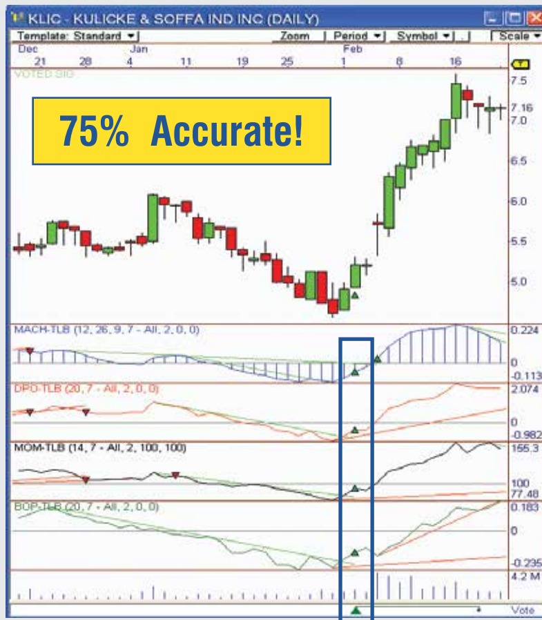
i TLB Power in Action. When multiple i TLB Systems fire Long within a few bars, a Long Signal is generated. A STRONG MOVE usually follows from this point, as shown in this chart for KLIC.

The i TLB2 Power Strategy is just another testament to the power of the i TLB concept. In the same way we used the i TLB Systems to create i TLB Power, you can use them to create your own Strategies in Strategy Builder. The i TLB package offers incredible value for our OmniTrader users. I guarantee you won't find ANY System that has shown itself to be this accurate or this profitable at this price.