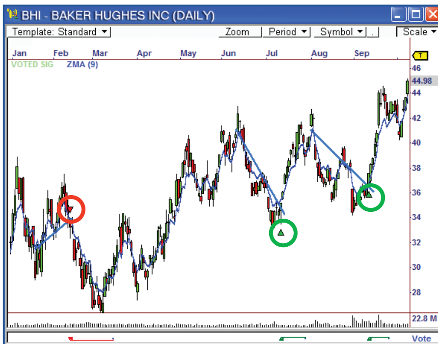
Here are some signals on BHI from the new TLB Moving Average (MA) Break Strategy, which uses the iTLB-MA System. Note how well this technique captures excellent entry points on short term trend reversals.

How do the new iTLB Signals compare to Signals on traditional price trend line breaks? There are times when the Moving Average trend lines are very close to price trend lines. However, Moving Averages often filter out noise in the price data, which means a good trend line can be detected even if price movement is somewhat erratic.