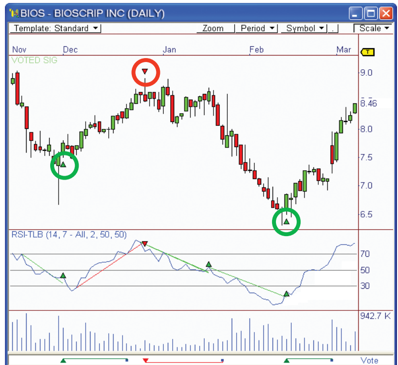
The RSI Trend Line Break (RSI-TLB) System: Sudden reversals in momentum are often indicative of a change in trend. Notice that most of these Signals occur on the earliest possible bar of the reversal.

But we only want to trade the best and "sharpest" reversals, which generally occur when Momentum and other indicators decisively break a prior trend. What is the best way to determine a sudden change in trend? A Trend Line Break, of course!